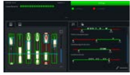
Via the ejection line, the multiple readings of each product are evaluated together and the result is transmitted in real time.