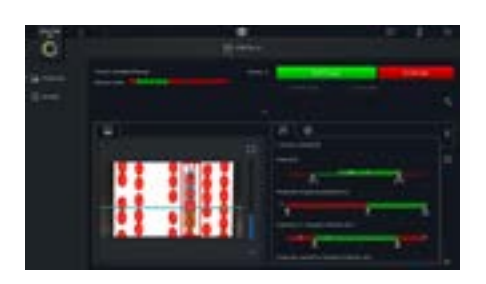
The software offers visualisation of the product parameter thresholds.

With three ejection modes, SPECTRA Bulk empowers you to optimise your ejection. Furthermore, the lane-specific results allow an analysis of the feeder to further increase productivity. Finally, as products are traced and evaluated multiple times, any jumping products are still fully analysed and only ejected if they do not meet the product thresholds.